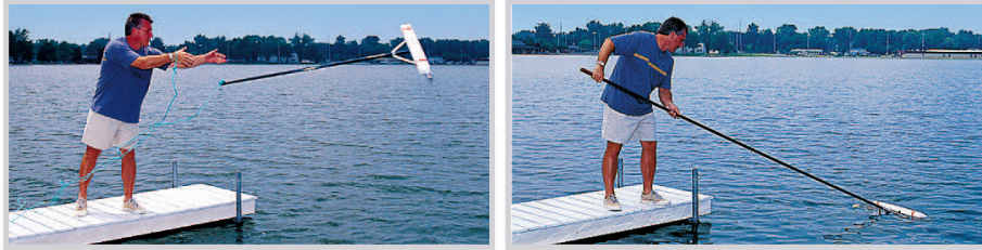
Throw and retrieve using the attached rope, or can be used with its two-piece 11' handle.

This 36" wide aluminum rake comes with an 11', two-piece rust proof powder-coated aluminum handle with push pin splice for easy assembly and disassembly, detachable polyethylene float, and a 50' length of rope. Use it to skim floating aquatic vegetation and algae from the water. By shortening the handle and removing the float, you have a professional-grade landscaping rake, excellent for dressing beach sand.