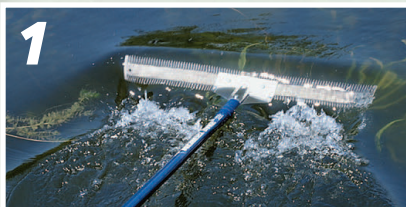
Simply skim the AWE across the water and let it sink