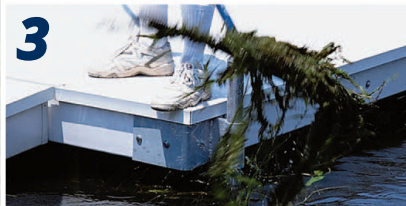
Drop the weeds off