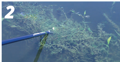
Retrieve in a short push-pull action